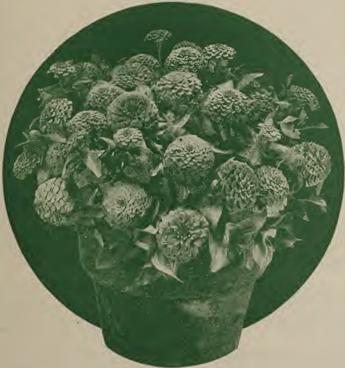
Zinnia Lilliput Tom Thumb Mixture

ZINNIA TOM THUMB MIXTURE —Tom Thumb is without exception the dwarfiest zinnia known. The plants are rounded and compact, 4 to 6 inches high, literally covered with well formed flowers of the Lilliput type. The color range includes red, orange, yellow, pink, rose and other pastel shades. Price Pkt., 15c.